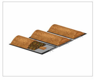
Bio Stabilized Aerated Static Pile (BASP)