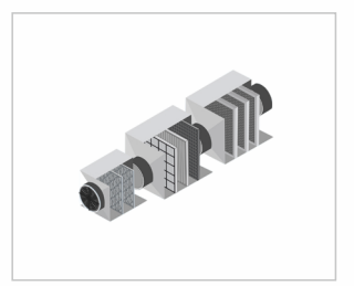
Indoor Air Quality Control Technology for Parking Lot